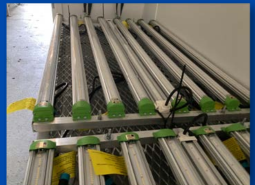
Bios Icarus LI LED Fixtures pre-install

Since this was part of our initial commercial expansion, the rebate provided much-needed capital for other equipment vital to the operation.