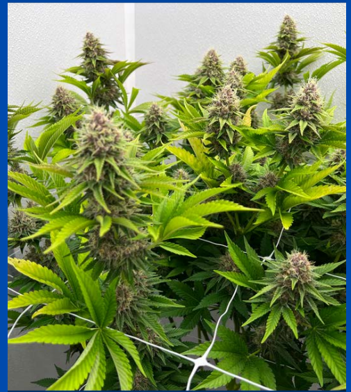
45 Days into Flower