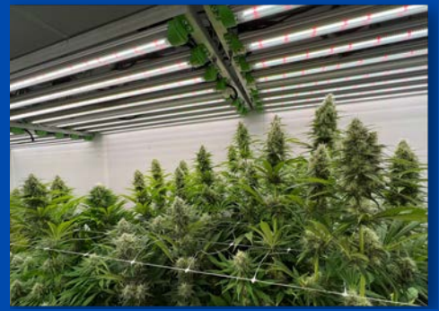
25 Days into Flower

Absolutely. With a partner like Climate Resources Group, there's no reason why we wouldn't pursue a rebate the next time we plan to expand. After we share our specs and tell our story, CRG can do the heavy lifting on the calculations and making the energy savings projections real.